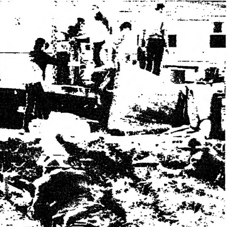
British troops take up firing positions as residents of Lenadon Estates in Belfast load furniture onto truck during evacuation of their homes.

BELFAST (UPI). — Shootings and explosions claimed five more lives in Northern Ireland yesterday. Some 6,000 Catholic families fled their Belfast homes because of the mounting violence.